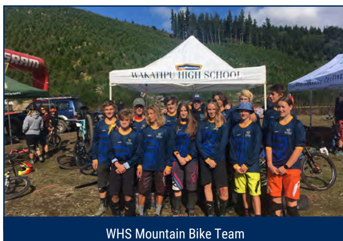
WHS Mountain Bike Team