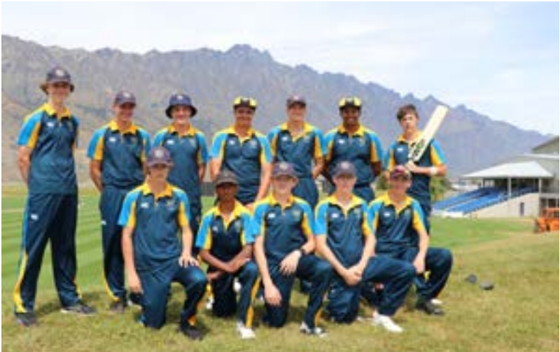
First XI Cricket Team

The WHS First XI competed in the 4th annual Queenstown Schools Cricket Carnival in late January. Eight teams from Christchurch, Dunedin, Invercargill, Queenstown and Australia competed for four days across two different formats, declaration matches and T20 games. There were a number of games for a tired WHS team, many players just returning from the cricket tour to Australia. Results were mixed but the players enjoyed competing against some good teams, especially on home soil.