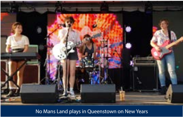
No Mans Land plays in Queenstown on New Years