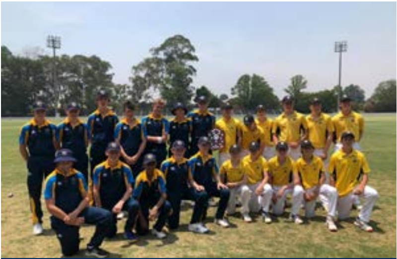
Junior Cricket Team at the U15 Western NSW Tournament