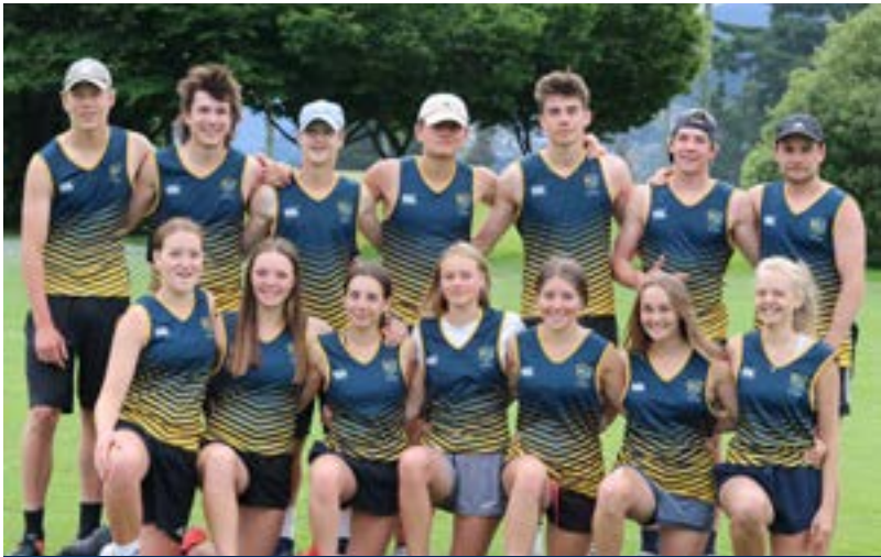
Senior A Mixed Touch Team

Congratulations to the Senior A Mixed Touch Team who had a very busy end of 2019. The team competed at the NZSS Champs in Rotorua for the first time and had 3 wins and 6 losses to finish 24th out of 34 teams in the mixed grade, an awesome effort! They then went on to win the local Queenstown Adult Module A grade, the first school touch team to do this. 2020 is looking good for another successful year for Touch so watch this space.