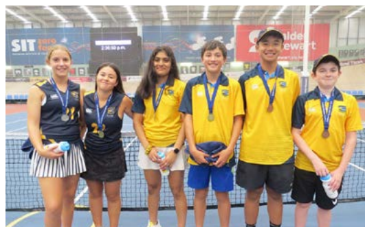
Wakatipu Tennis Team