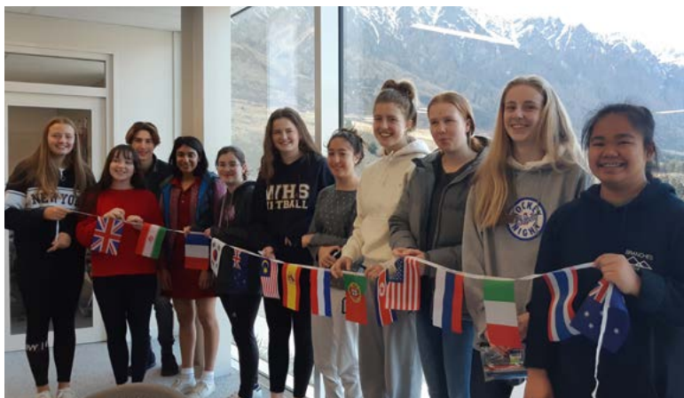
Students Awarded B1 & B2 DELF Certificates