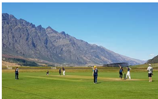
Bates Cup v Blue Mountain