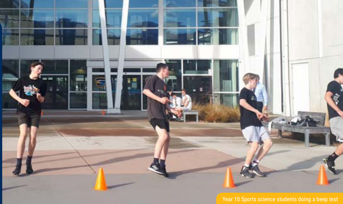
Year 10 Sports science students doing a beep test