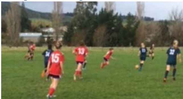
WHS Girls 1st XI in action vs SGHS

This year WHS has entered a team into the Girls Secondary School College League competition for the first time. This is an exciting step forward for the sport at WHS and offers the girls regular competitive matches. The team went down to Lumsden with 11 players this week, a mix of experienced players with a number of Year 9s and beat Southland Girls 3-1 on a wet and stormy afternoon. Once the sheep were shifted off the field it was game on and a great start to the season.