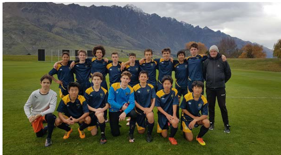
Wakatipu High School 1st XI Football Team

The WHS 1st XI began their qualifying campaign with a 3-2 win over Timaru Boys High School at the Event Centre on Tuesday morning. The match was tight with a number of learnings to improve from. The team's next qualifying match is against Otago Boys High School on Monday 28 May at school.