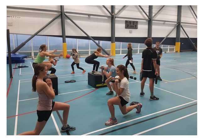
Sports Academy students circuit training in the gym.

Good luck to the 12 competitors heading to Dunedin for this Sunday's annual Otago Secondary Schools Swim Champs.