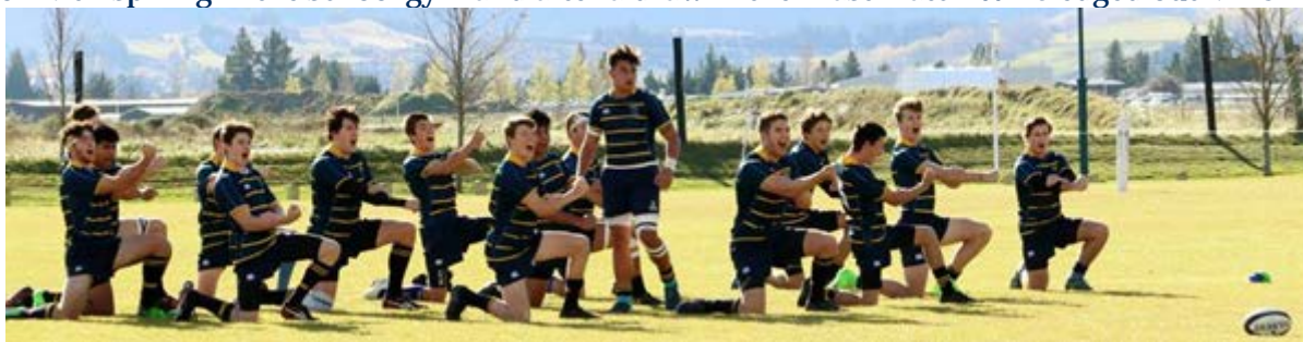
The 1st XV acknowledged the significance of the first match at the new WHS with a haka

The senior A netball team took on Mt Aspiring in the school gym and after a draw in their last match WHS edged out MAC 28-24.