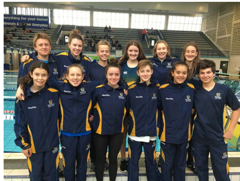
The team as pictured