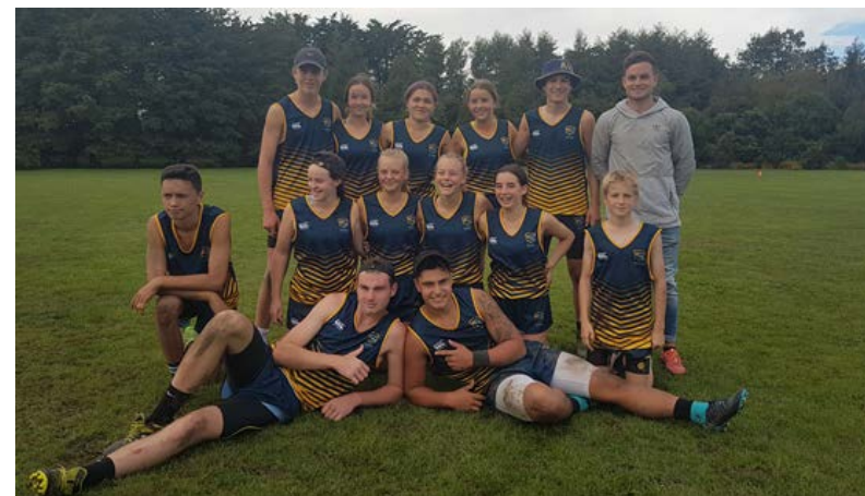
WHS mixed Touch Team