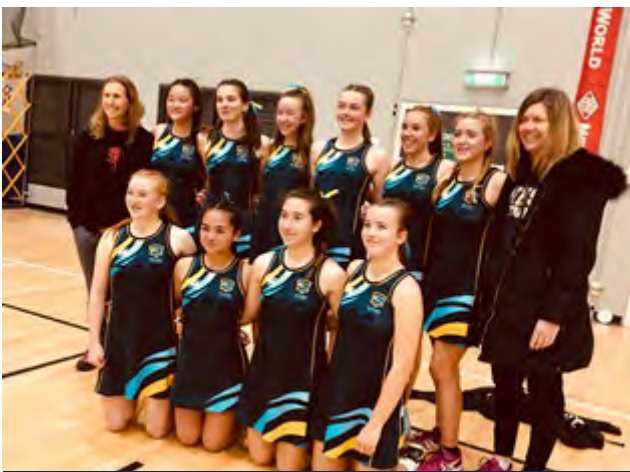
Year 10 Firebirds