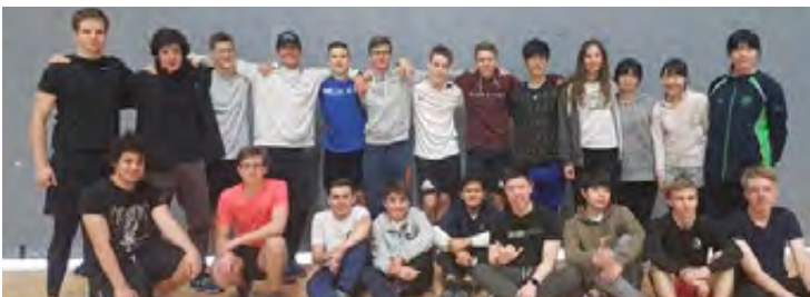
WHS International Students

Yesterday 22 of WHS’s 67 current international students travelled to Invercargill to participate in the Southland Secondary School International Student Sports Day. 260 of Southland’s international students had the opportunity to experience two sports during the day. They learnt the rules, basic skills and had plenty of game time all the while interacting with other international students. The sports on offer were basketball, volleyball, squash, futsal, dodgeball, badminton and track cycling at the velodrome. Thank you to Study Southland and ILT for sponsoring the event and to Southland Secondary School Sport for putting it together.