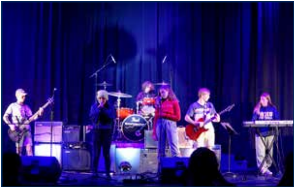
Big Break: Audiosnake