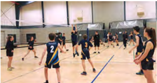
Action from the CO Volleyball Tournament