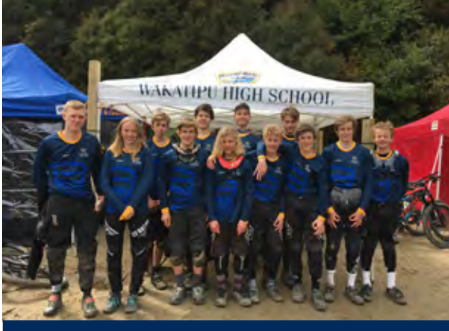
WHS MTB Team at SISS Champs