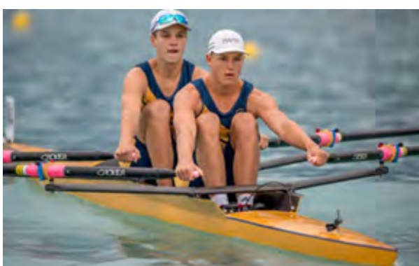
U15 Boys Double Skulls crew are finalists for the Southland Secondary School Sports Team of the Year